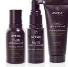
invati ultra advanced™ mini system rich exfoliating shampoo rich (50 ml) thickening conditioner (40 ml) scalp revitalizer (30 ml)