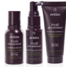
invati ultra advanced™ mini system light exfoliating shampoo light (50 ml) thickening conditioner (40 ml) scalp revitalizer (30 ml)